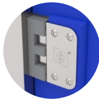
All stainless steel SPENLE hinge