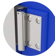
Stainless steel double-acting hinge