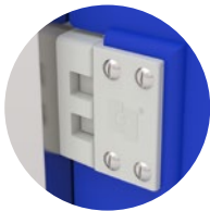
All stainless steel SPENLE hinge with Delrin® body